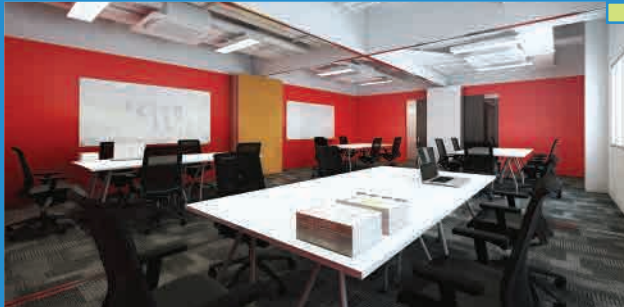
game development studios

Formerly known as the Games Solution Centre (GSC) @ Blk 71, PIXEL Studios is a creative space that seeks to provide a rapid prototyping development environment for Singapore-based small-medium game enterprises to develop their games. PIXEL Studios also promotes game content through pavilions at key market events.