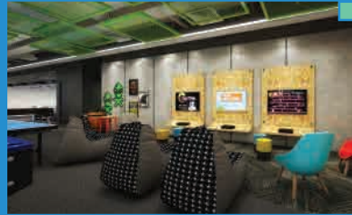
game testing & play area

Networking events and seminars are at the core of this space. Learn from industry experts and leading digital brands through masterclasses and workshops, or network with like-minded creative talent here.