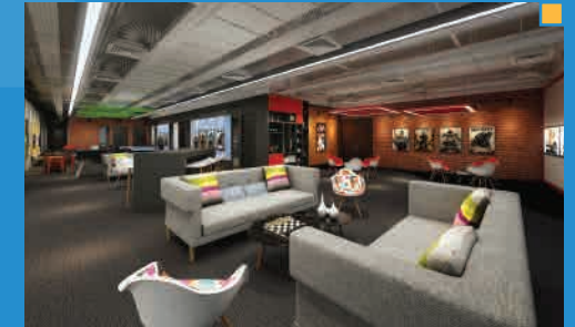
common area for meetings, hot-desking and filming

Mingle and connect at these various touch points to build creative ideas amongst fellow game developers.