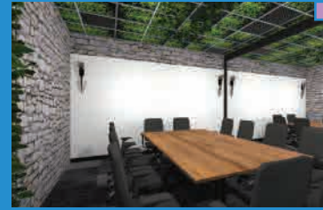
themed meeting rooms

Chill out with some of the latest console games or test your prototypes at this zone. The game testing and play area can host game consoles (PlayStation®, Xbox, Wii, etc), and each station can be hooked up with smart tablets and interactive PCs to showcase and test games.